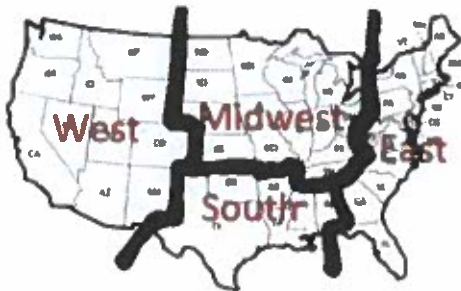
Regional Futurity Map

14. Premiums: A Minimum of $3000 will be awarded and divided among the top regional exhibitors. There will be 4 regional areas receive awards. You may only be eligible for awards within the region you reside. (See regional map below). Points may be obtained at shows outside your region but they can only be applied to the national overall award. You may not be eligible in two regions for awards. All futurity ewe lamb exhibitors are eligible for the overall national winner. The guaranteed monetary amounts are as follows: Regional awards First Place - $300; Second Place $200; Third Place - $100; Fourth Place - $100. National Champion $200 Bonus.